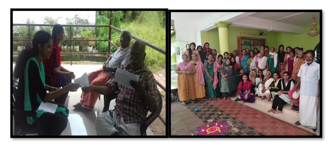
Computer Literacy Workshop for Sister Candidates

Department of Computer Science and Applications organized a two-day Computer Literacy workshop on 22-06-19 & 29-06-19 for sister candidates of Nirmala province. Most of the students who attended the sessions was not familiar with the basic usage of computer, preparing documents and presentations. So their Basic requirement was to acquaint with the use of computer and preparing documents and presentation slides for future use. Our objective was to give a basic awareness Computer Fundamentals and Microsoft Office. The students were able to create documents, manipulate and formatting documents, creation and formatting of beautiful slides, excel worksheets and solve problems using formulae in worksheets during the hands on training sessions.